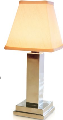
Lacquered Bright Chrome with Fabric Shade