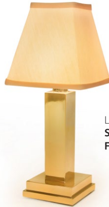
Lacquered Solid Brass with Fabric Shade