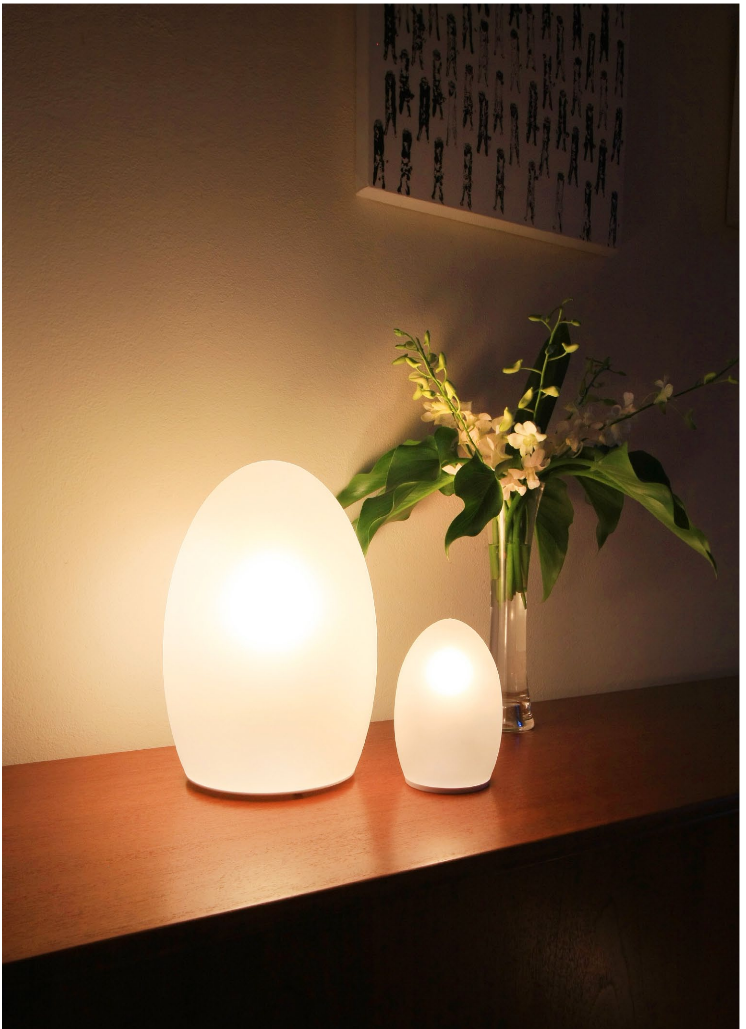
EGG LARGE & SMALL Home Installation