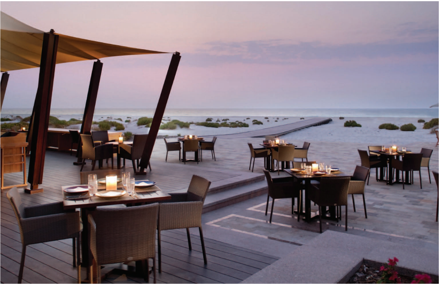
LITTLE COLLINS Park Hyatt Abu Dhabi Hotel and Villa