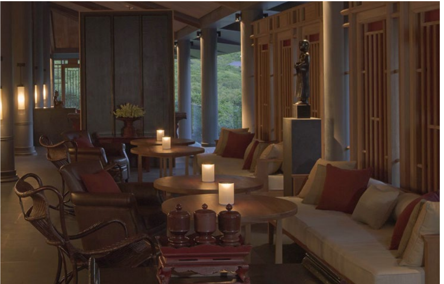
LITTLE COLLINS Amanoi Vietnam