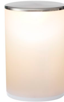
Brushed Stainless Steel Top with Acrylic diffuser