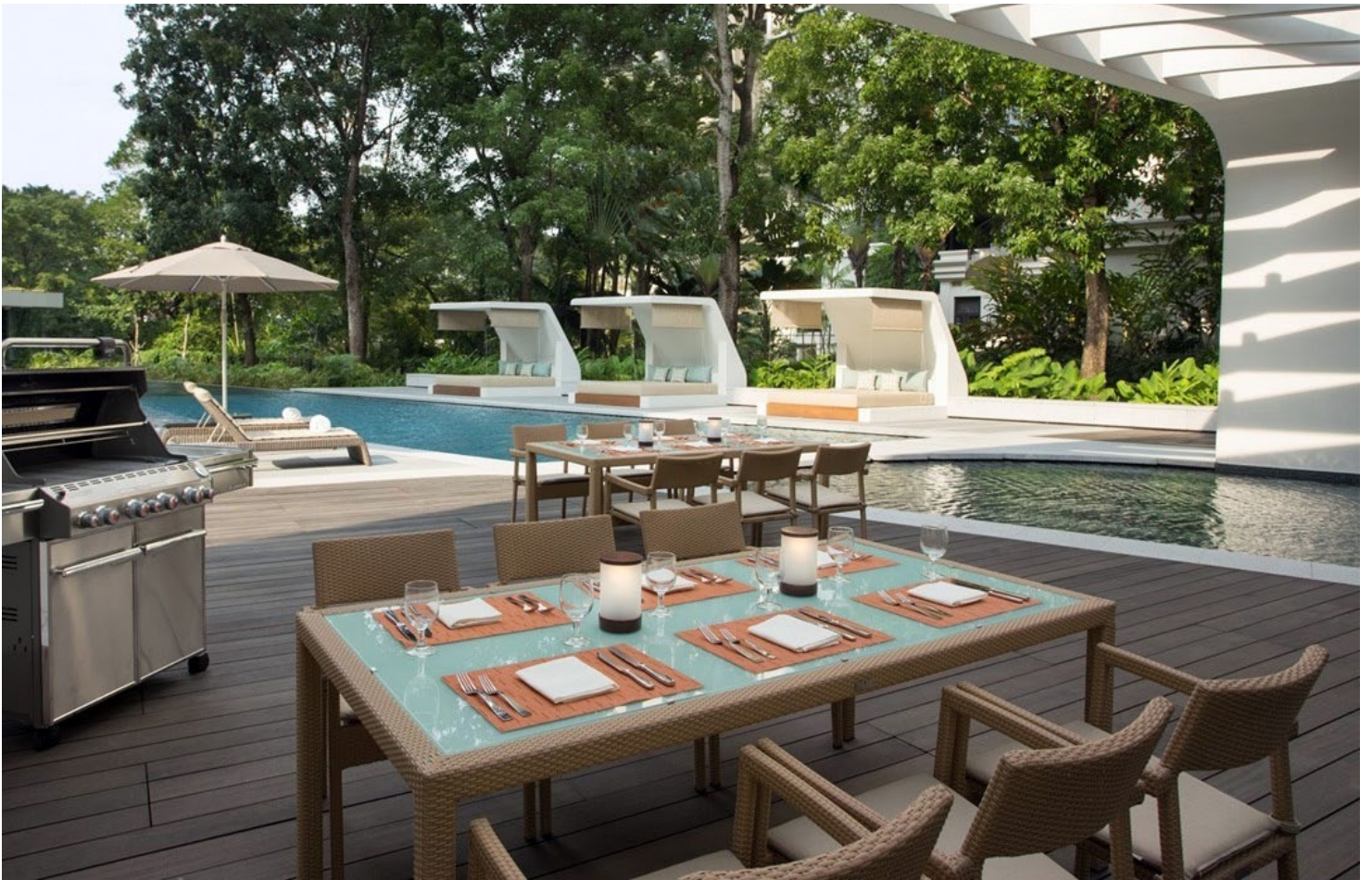
Wood - Jarrah Ardmore Residence, Singapore