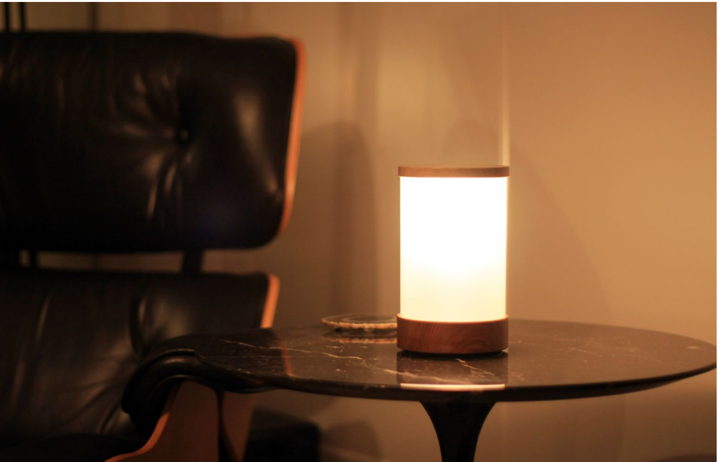
WOOD - VICTORIAN ASH Potts Point Residence, Sydney