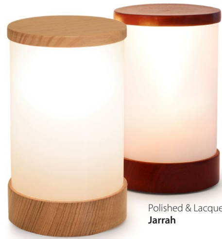
Polished & Lacquered Victorian Ash